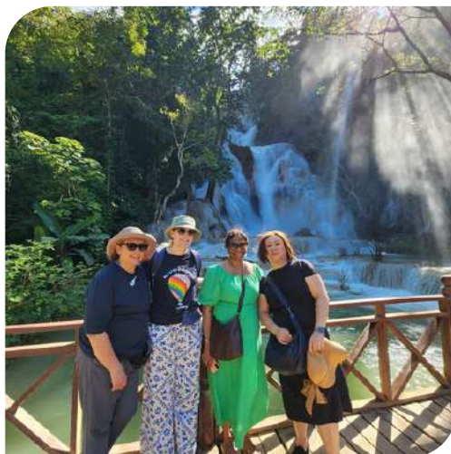
Beautiful Kuang Si