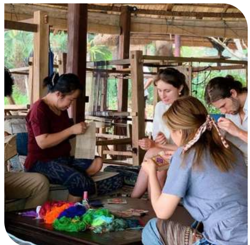
Ock Pop Tock Living Craft Center