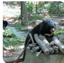
Bear Rescue Center